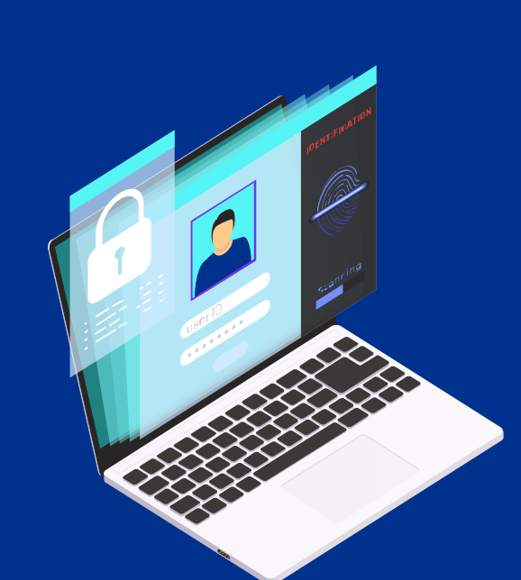
Advanced Risk Scoring