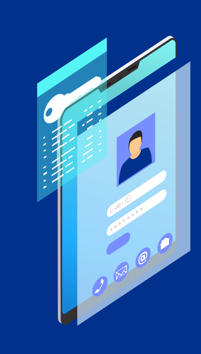
Integration with Existing Systems