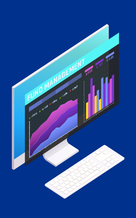
Compliance with Regulatory Requirements